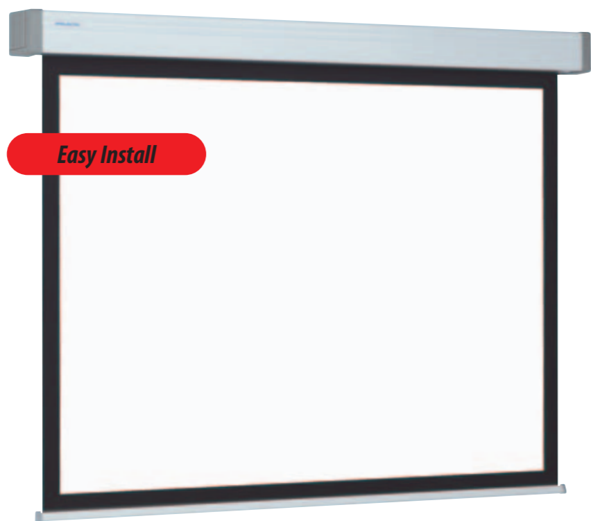
▲ Top quality, electrically operated projection screen with a wide selection of aspect ratios, sizes and screen fabrics.